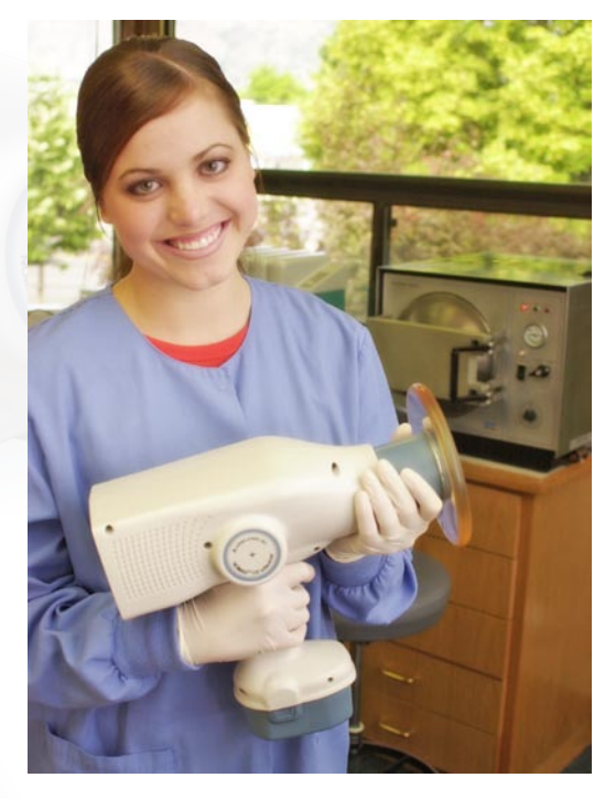
"It's so easy to use and it saves time!"