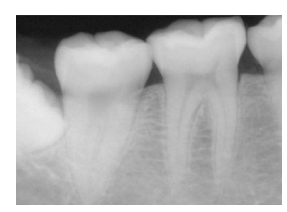
Post-mortem image using NOMAD with a Digital Sensor

NOMAD provides all the benefits of DC performance: highest quality images and lowest patient dosage. NOMAD's high-frequency, 60kv DC x-ray generator provides constant radiation output. This improves image quality while reducing the dose to the patient relative to traditional half-wave (AC) generators.