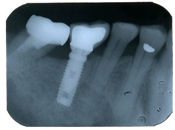
D-Speed Film, 0.5s