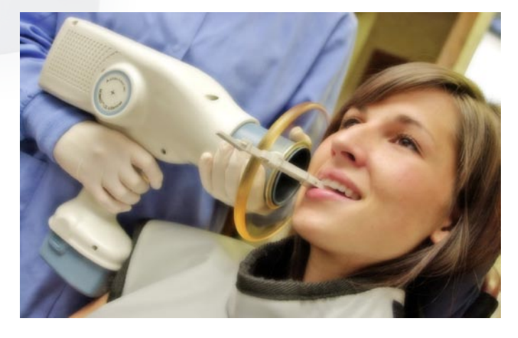
Using NOMAD is quicker and more comfortable for the patient.